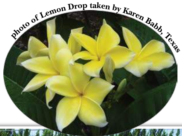
Photo of Lemon Drop

In my unscientific evaluation and opinion only, the Lemon Drop is one tough and resilient plant and a "Keeper" in my collection. I welcome your observations and opinions on this magnificent plumeria.