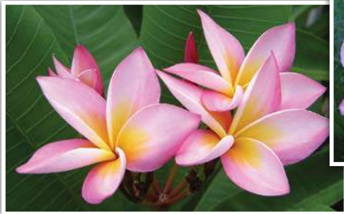
Photo of Nancy Ames Rainbow