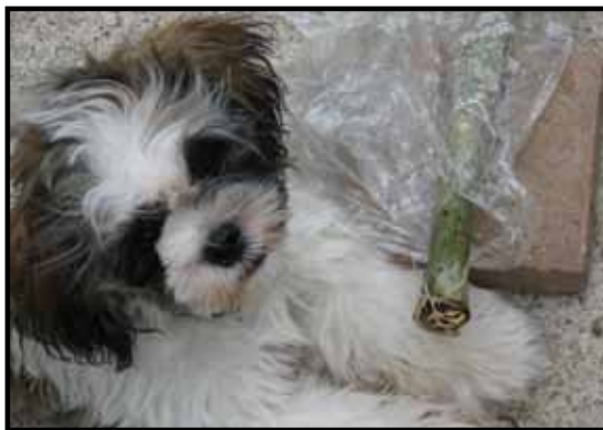
Figure 2: A cutting has rooted with the end wrapped in plastic wrap.

The photo below is of my dog Snickers and one such plastic-wrapped rooted cutting.