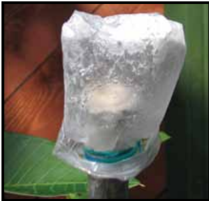
Figure 1: A previously dry air bag has become wet in only a few days.

Plastic Wrap as a Rooting Enclosure: Other prior tests have demonstrated that cuttings only need humid air space to send out roots and that the cuttings will supply adequate moisture into any small enclosure to both establish and maintain humid air.