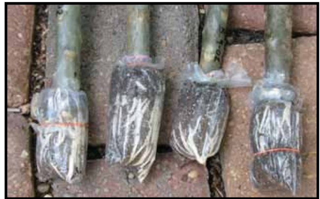
Figure 5: Photo taken September 24, 2010. Cuttings bagged on September 2, 2010 have filled with roots in 22 days. The rooting mix protects the initial roots from becoming drenched in condensate and supports the humidity of the air spaces. Once well rooted, the mix becomes dry but root damage from dry air is avoided.

Occasional condensate on the inside of the bag is normal and acts as a reserve of moisture. This reserve of moisture is useful initially for when temperature changes cause the air to become thirsty and later when new leaves cause the roots to remove moisture from the bag.