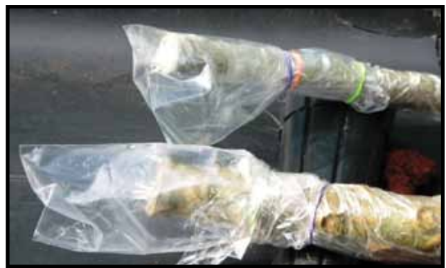
Figure 4: Photo taken October 6, 2010. Cuttings taken August 9 and August 2, 2010 were wrapped with Saran™ wrap and rooted in air bags. It is not recommended to allow roots to grow this far in an air bag because the roots may gather condensate, become drenched, turn black, and die.

Rehydrating and Feeding Cuttings: With tub soaking of cuttings prior to insertion into a rooting medium the dried cut end becomes wet.