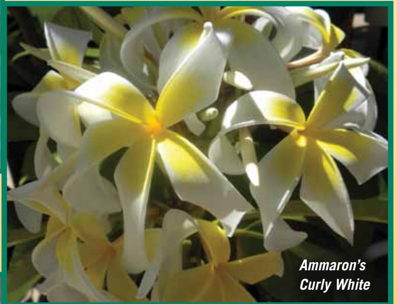
Ammaron's Curly White