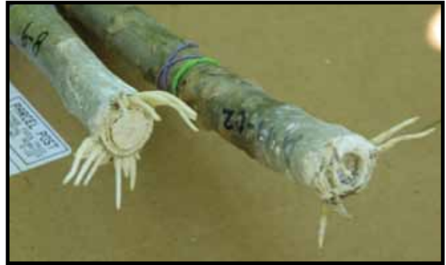
Figure 3: Two cuttings have formed roots in the humidity of air bags with only the cuttings providing moisture.

While the rooting cutting can be wrapped in plastic wrap, the preferred way to see the formation of first adventitious roots is to have the rooting end in a small rooting bag with medium.