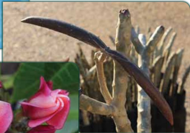
Seedpod on Red Santa