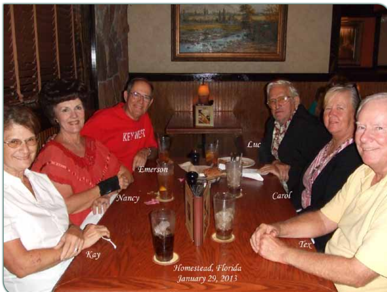
Homestead, Florida January 29, 2013