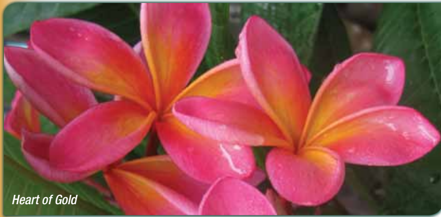
Heart of Gold