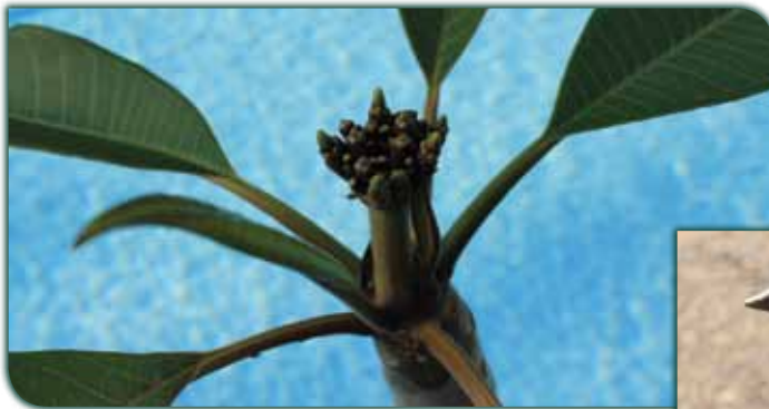
Inflo on Raspberry Sundae