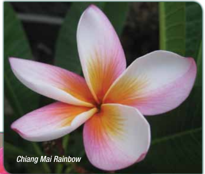
Chiang Mai Rainbow