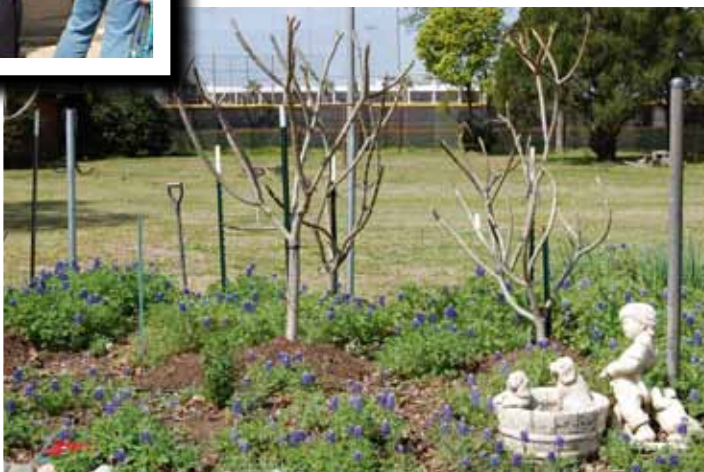
Bluebonnets and Plumeria