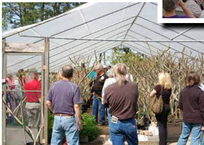
Greenhouse tour—a big hit!