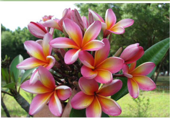
Gold Coast Peachy