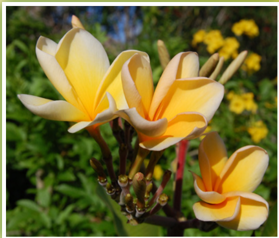
Bali Hai Gold