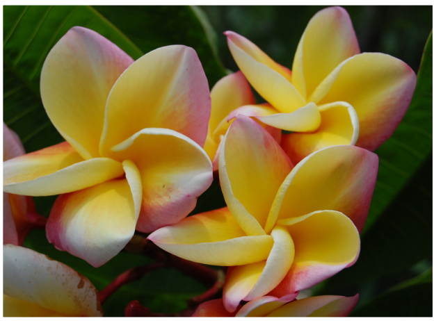
Bryan Holland's Yellow Seedling