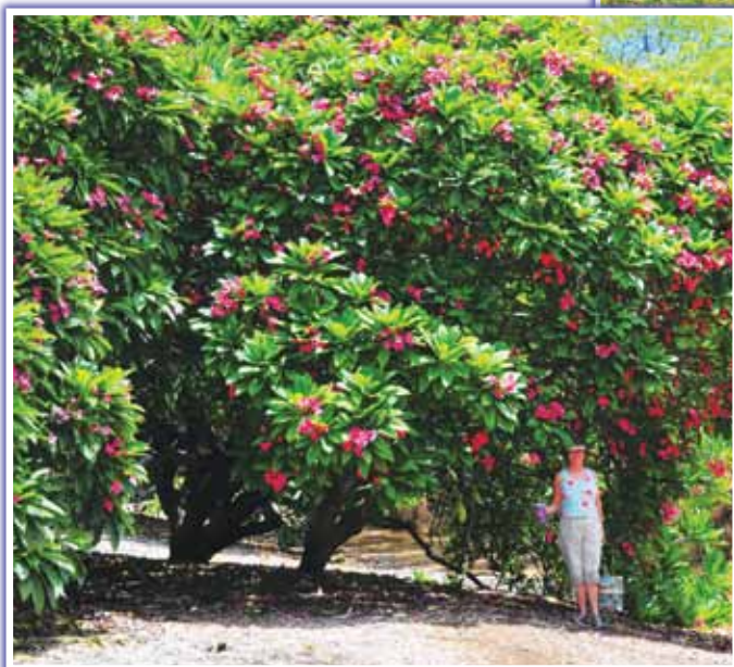
Trish and Roy Weeks visiting Koko Crater, Oahu, Hawaii

plumerias. However, no major strong roots ever develop from the wood that develops over the soft white center of rooted cuttings. It was also shown that angle-cut plumeria cuttings develop roots only at the tip and with time develop no more roots to cover the cambium perimeter that contains no initial roots. Thus, it is very crucial to develop a vigorous and even root system when a cutting first develops roots. The only way to achieve this is by rooting square-cut plumeria cuttings, which initially develop vigorous roots all around the perimeter of the cambium line. The previously stated conclusion in my May 2012 Plumeria Potpourri article that long term it really does not matter how a plumeria cutting was cut is incorrect. In order to develop vigorous and even roots it is of paramount importance to use square-cut plumeria cuttings for rooting. Vigorous and even roots mean healthier and stronger plants.