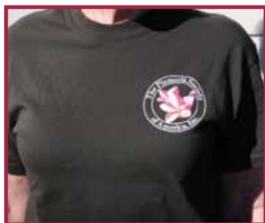
front of T-shirt