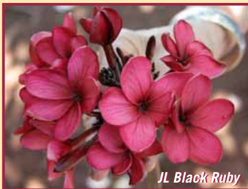
JL Black Ruby