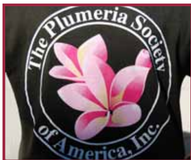
back of T-shirt

T-Shirts are 100% preshrunk cotton $10.00 plus $3 S/H