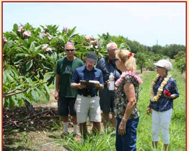
University of Hawaii Waimanalo Experiment Station, O'ahu