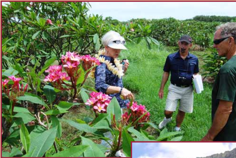
University of Hawaii Waimanalo Experiment Station, O'ahu