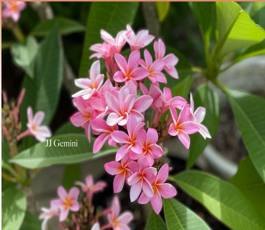
JJ Gemini in 2023 with increased inflo size.