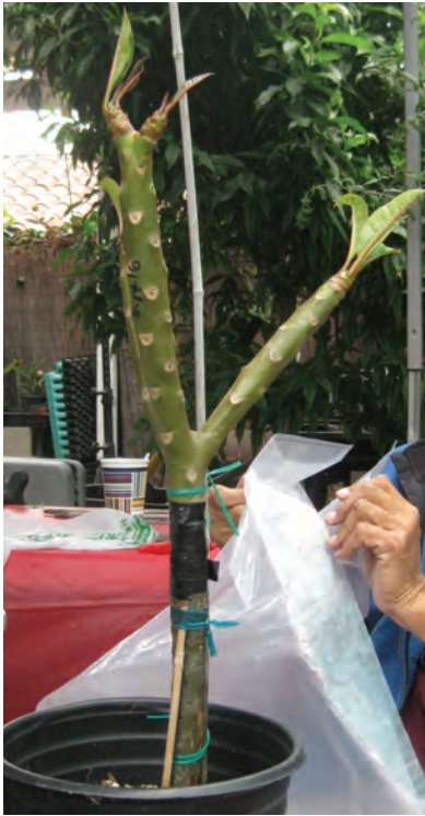
Cover the plant with a plastic bag.

Place a dampened, folded paper towel near the bottom of the bag—not on the soil or plant.