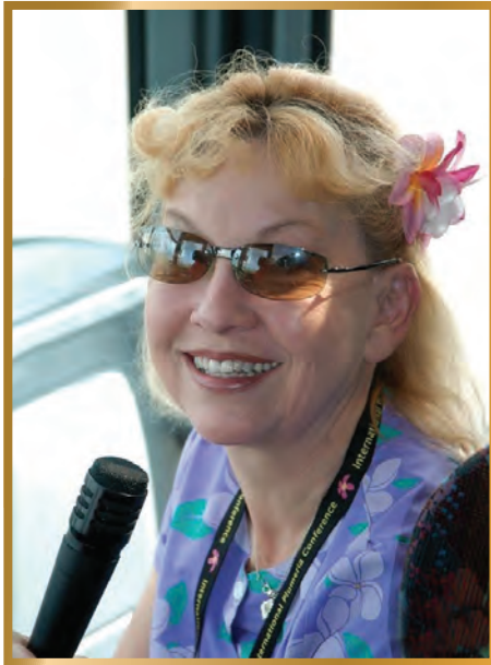
Lake Stafford