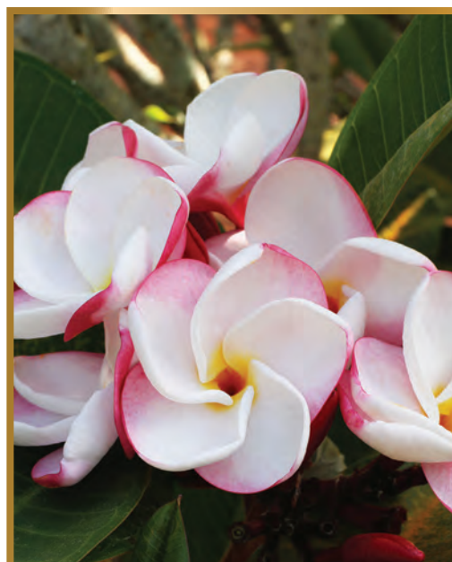
JL Pink Pansy