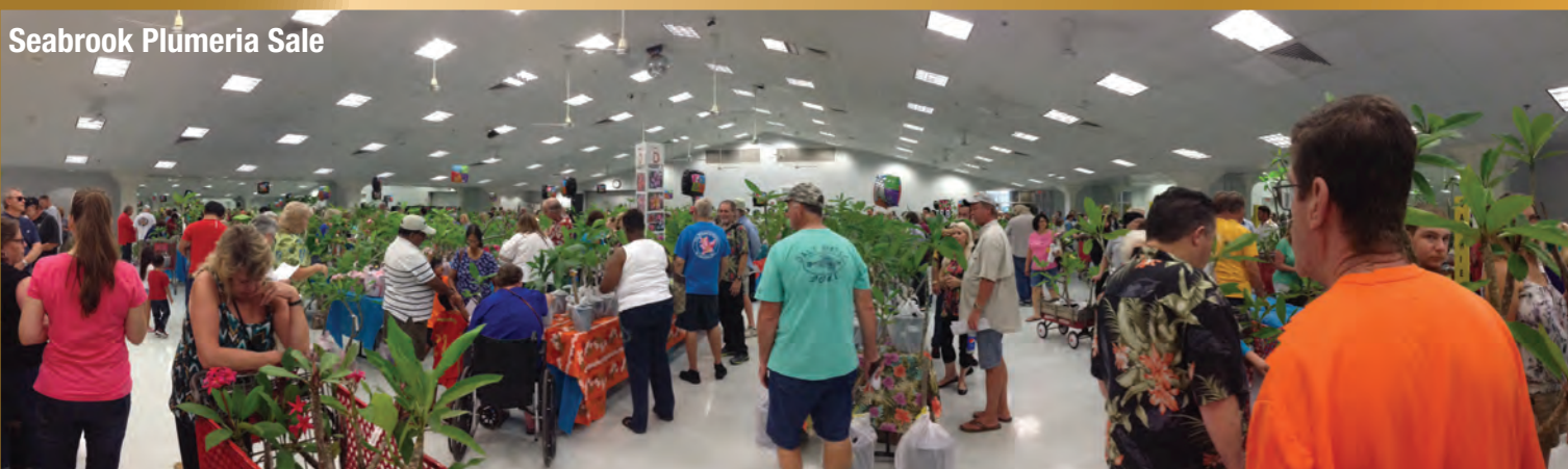
Seabrook Plumeria Sale

☞ Topics: Soil Amendments, New Plant Products, and Organics ☞