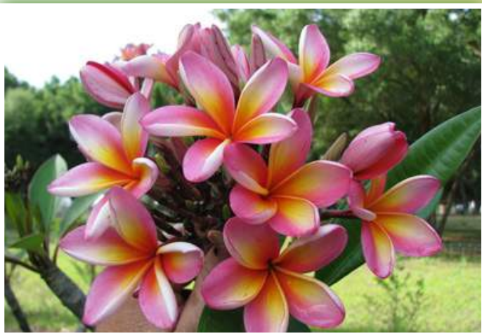
Gold Coast Peachy