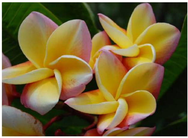
Bryan Holland's Yellow Seedling