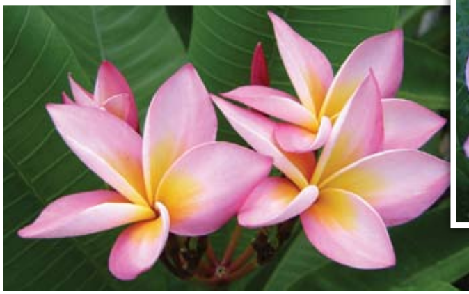
Photo of Nancy Ames Rainbow