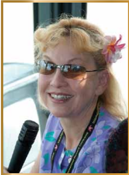
Lake Stafford