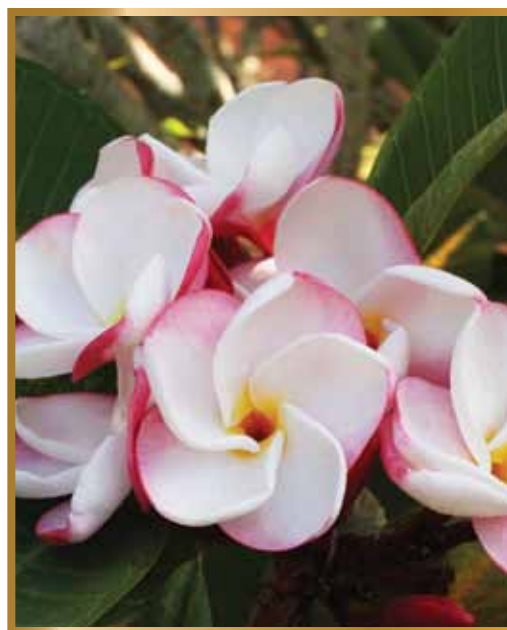
JL Pink Pansy