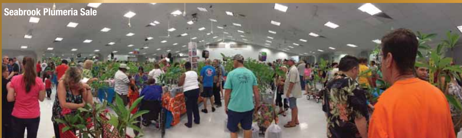
Seabrook Plumeria Sale

☞ Topics: Soil Amendments, New Plant Products, and Organics ☞